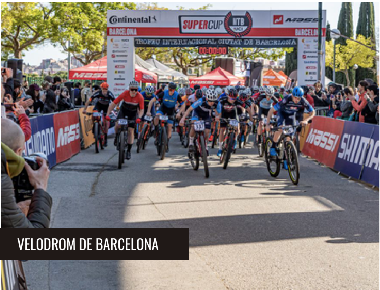
VELODROM DE BARCELONA

The International City of Barcelona Trophy. A race that always leaves us great moments around the Horta Velodrome. The appointment will be on September 9.